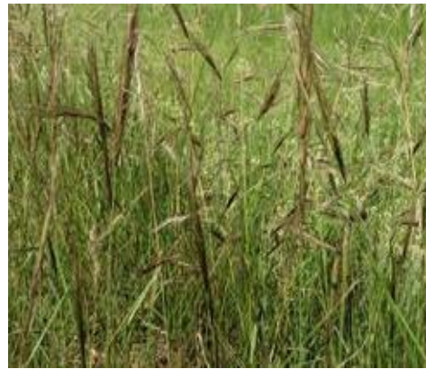
Wild Grass and seeds