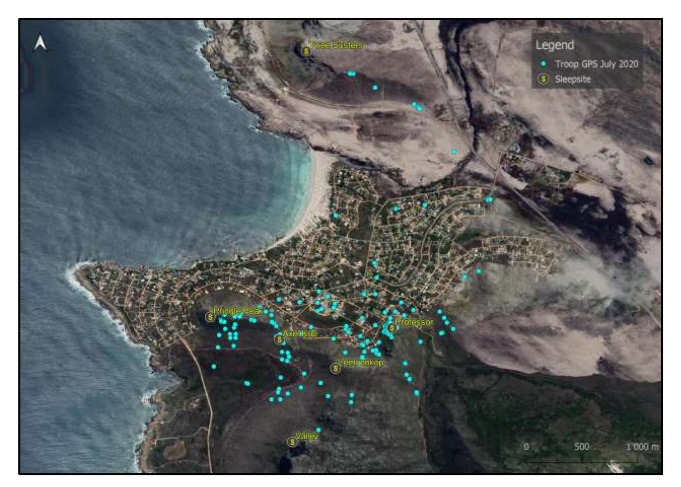
Figure 3: GPS locations of the Pringle Bay Troop as determined by the GPS collar during July 2020.