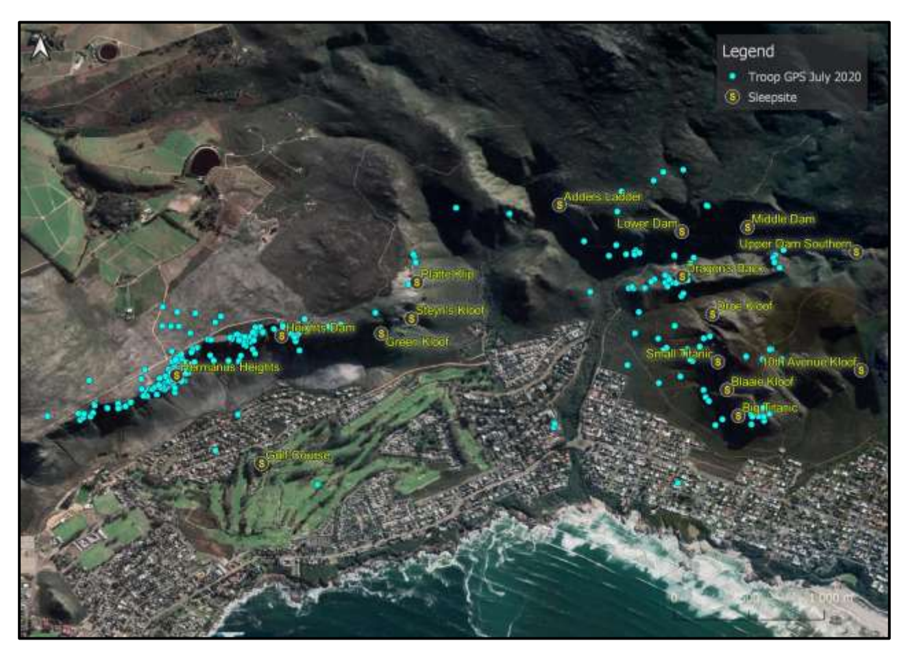
Figure 1: GPS locations of the Voëlklip Troop as determined by the GPS collar during July 2020.